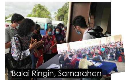
Balai Ringin, Samarahan