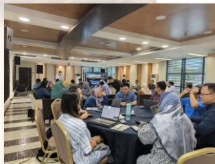
Open Science's Workshop