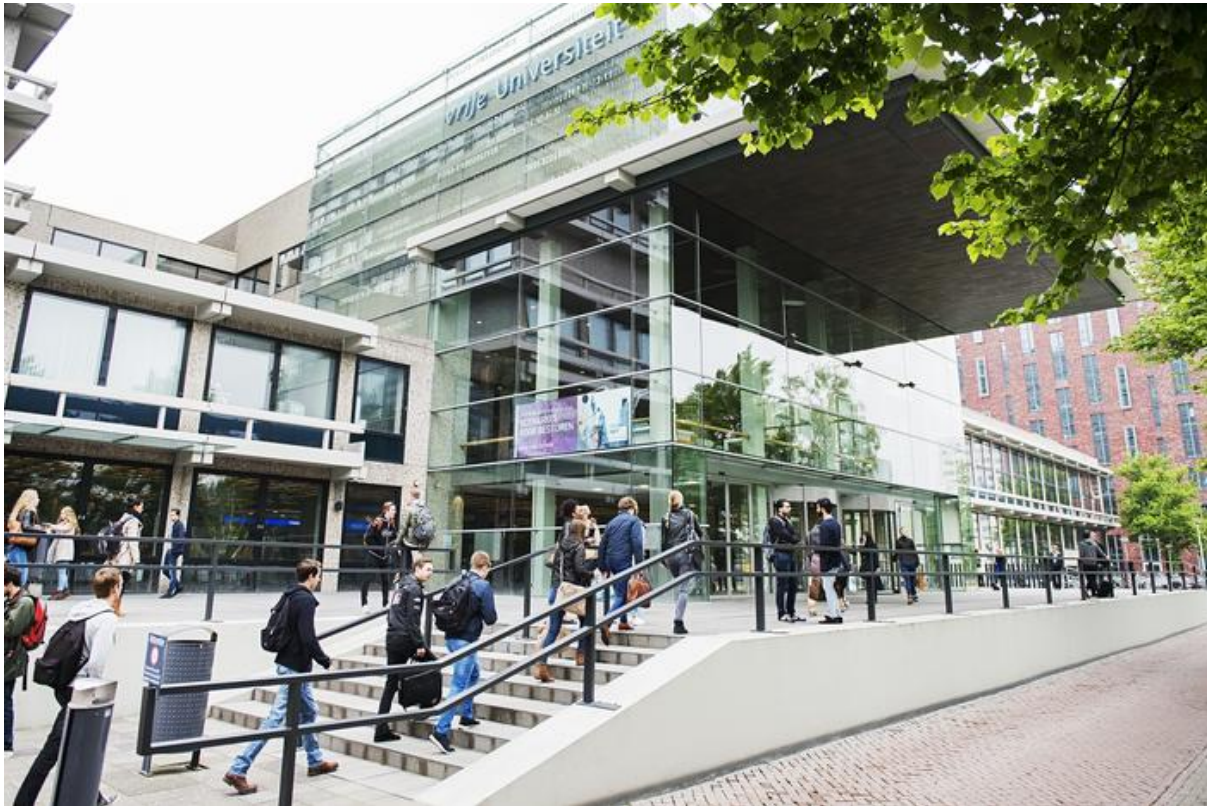
Entrance of main building

from which you will see elevators. Please take the elevator to the “Church room” by either going directly to 16 th floor or to the 15 th floor (and then you walk the stairs to the 16 th floor room) There will be someone at the entrance guiding you to the right room.