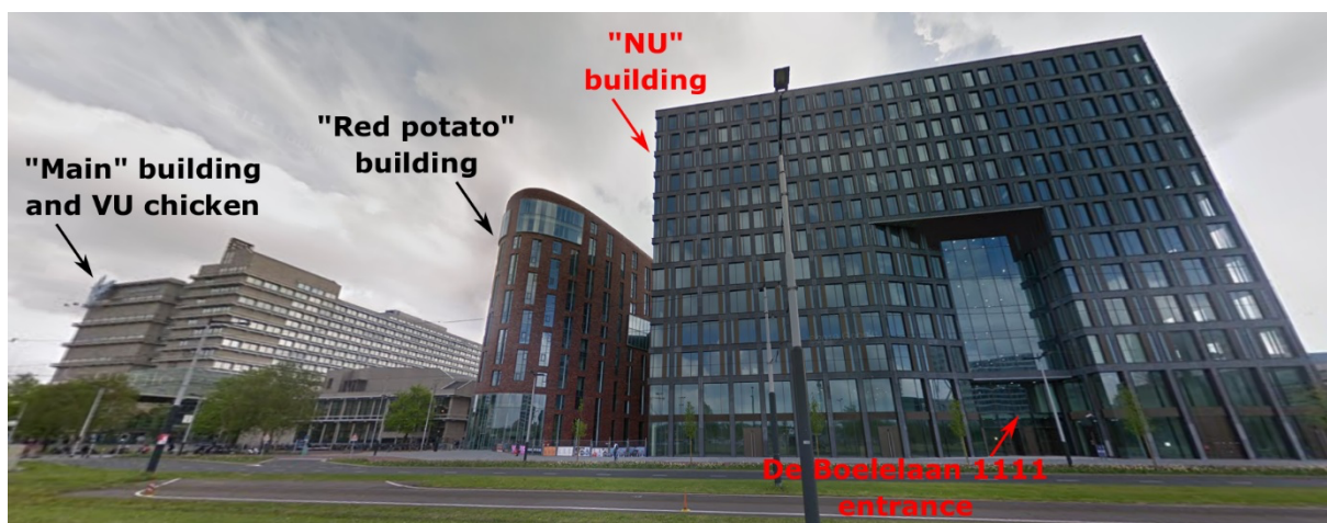
Picture of the NU-VU building and the entrance at De Boelelaan 1111

The entrance of the NU-VU building is depicted in the next image, you can enter through the revolving doors. The events on 18 th and 20 th June will mostly take place in this building.